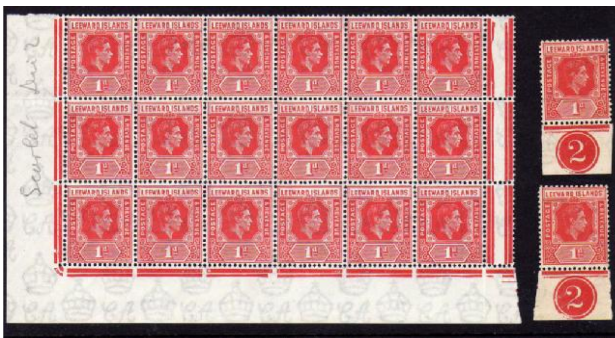
Lot 483 part