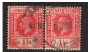
Lot 297 part